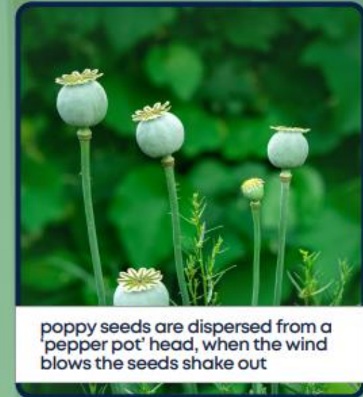
poppy seeds are dispersed from a 'pepper pot' head, when the wind blows the seeds shake out