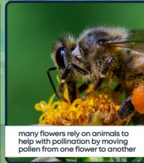
many flowers rely on animals to help with pollination by moving pollen from one flower to another

spreading things out over an area , seeds do this to help to reproduce