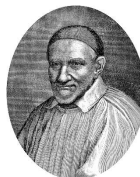
Sir Vincent de Paul

Petition: a request made for something desired, especially a respectful or humble request, as to a superior or to one of those in authority.