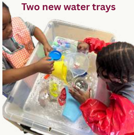
Two new water trays