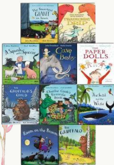
New books for the library