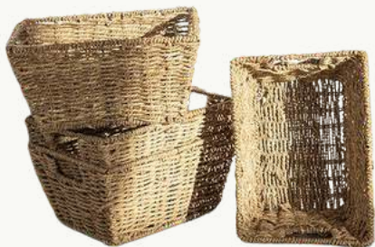
Storage baskets for the classrooms