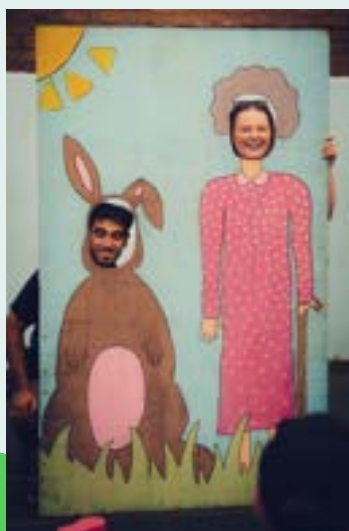
Splat the teacher