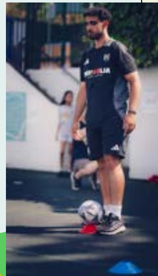
Fulham football club